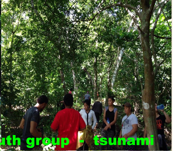
Utungake village youth group - tsunami route clearance and beach clean up.