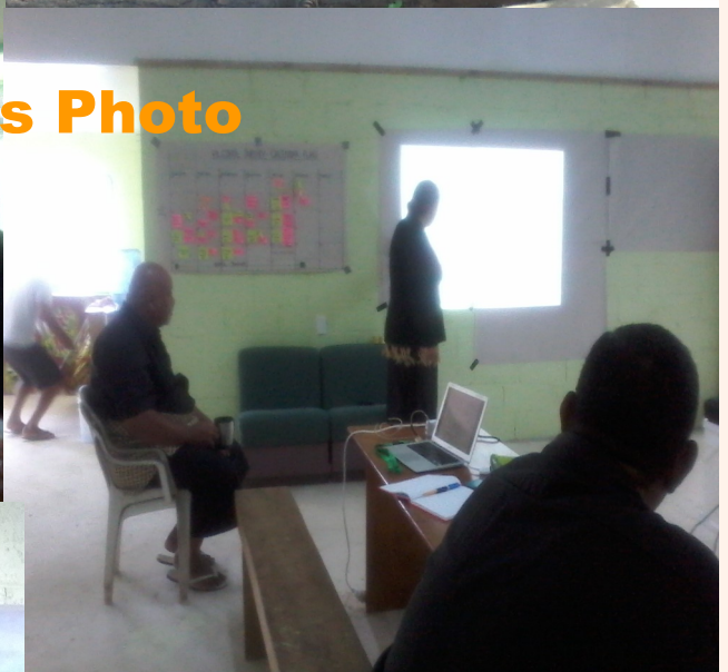
Tonga Skills Photo